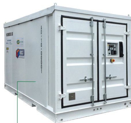
Insulated Stainless Steel internal tank

Including high quality stainless steel fittings throughout and many other valuable features as standard, HOST AdBlue Self Bunded Tanks really stack up on design and value.